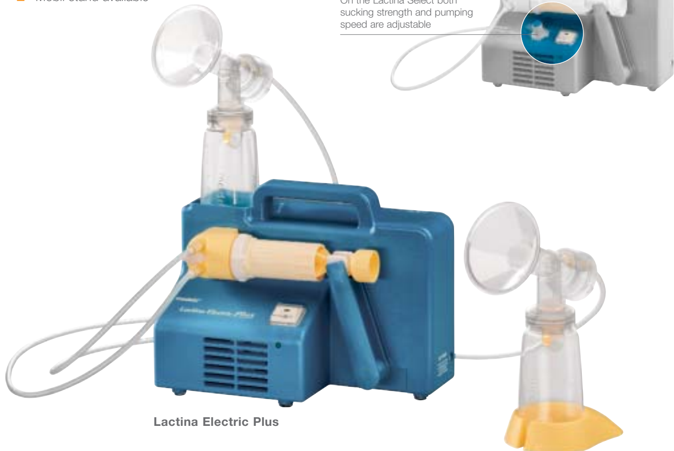
Lactina Electric Plus

On the Lactina Select both sucking strength and pumping speed are adjustable